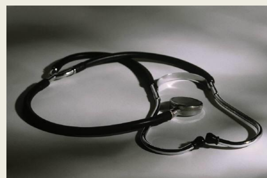
Figure 1. Label in 24pt Arial.

This text box will automatically re-size to your text. To turn off that feature, right click inside this box and go to Format Shape, Text Box, Autofit , and select the "Do Not Autofit" radio button.